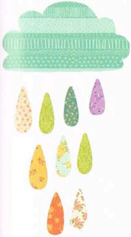
Fabric wall stickers, 'Summer Rain', £39.95, from Nubie. nubie.co.uk