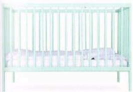
Cot, 'Mini' (dusty aqua), 84 x 124 x 64cm, £69.95; mattress, £14.95; both from MoKee. en.mokee.eu

I am not big on 'nursery furniture' or 'kids' stuff'. In fact, I am not sure I like style pigeonholes: I didn't want anything 'pregnancy' and, come to think of it, I don't think that I had anything 'bridal' at my wedding. So when it came to doing my daughter Margot's bedroom, I wanted somewhere that had the charm of a baby's room without the overpriced baby-themed furniture or fairy-motif curtains.