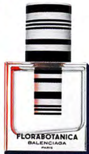
5 Metal and foam Tipi chair, £2,500, Eero Aarnio for Adelta at Chaplins. 6 Florabotanica eau de parfum, £53, Balenciaga at House Of Fraser. 7 Lacquered MDF Tree bookshelf in Grey, £690, Bobo Kids. 8 Silk-gauze top, £460, Isabel Marant at Net-A-Porter.